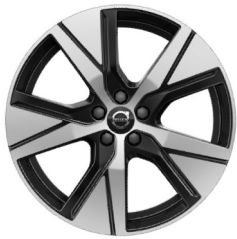
19" 5 Spoke (std Recharge Plus)