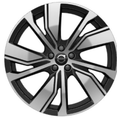
20" 5 V Spoke (std Recharge Pro)